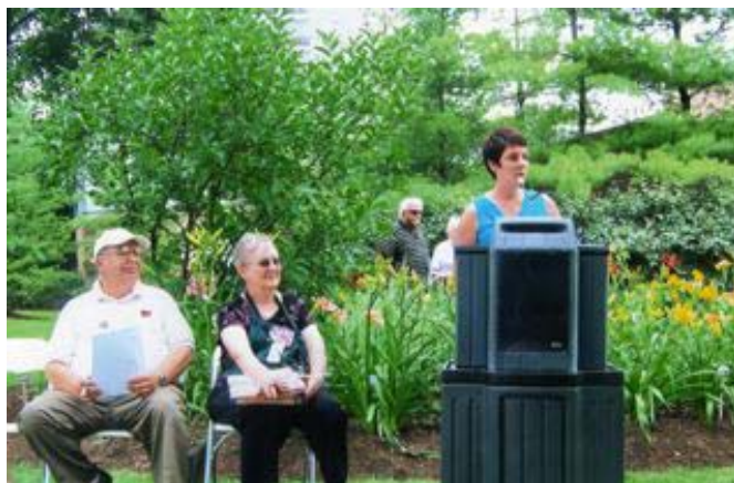
A snapshot from the Ohio Hybridizer Garden dedication ceremony, July 9, 2006, in Franklin Park.