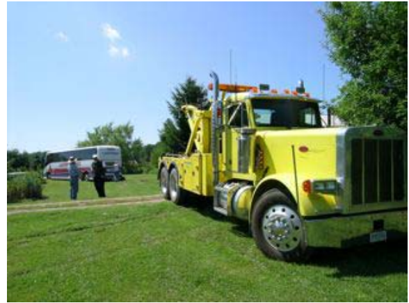
A much appreciated tow truck finally arrived to get the bus "back on the road."

Heading back into Gahanna, we stopped at the home of Bill and Sylvia Mellinger where they broke out the ice cream treats for a much needed energy boost. The Mellingers' beautifully