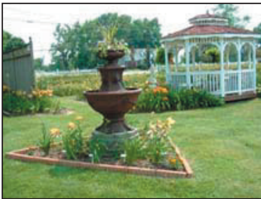
Pleasant Valley Gardens